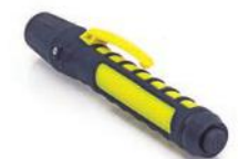
EASY PRESS ON/OFF OPERATION