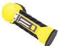
ANTI-SLIP RUBBER GRIP HANDLE & POCKET CLIP