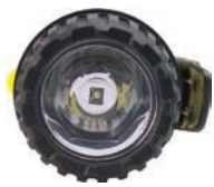
150 LUMEN WHITE CREE® LED