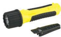
DETACHABLE POCKET CLIP INCLUDED